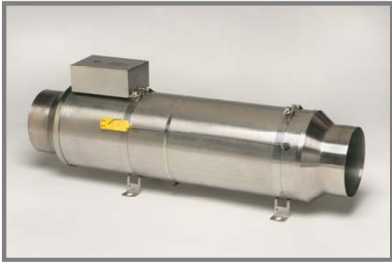
Shown with optional inlet & exhaust fittings