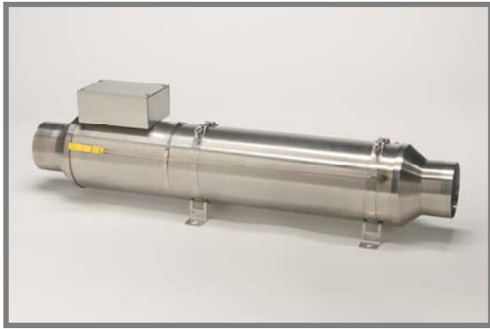
Shown with optional inlet & exhaust fittings