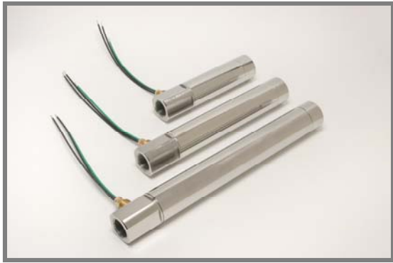
Shown with optional inlet & exhaust fittings